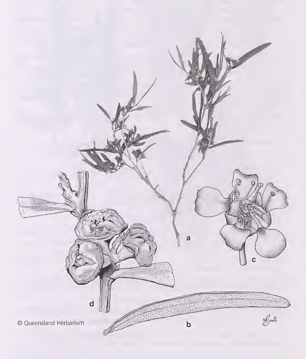
Fig. 1. Leptospermum anfractum a , flowering branchlet × 1; b , leaf, abaxial surface × 4; c , flower × 8; d , infructescence × 6. a, c from Bean 3867 (BRI); b , d from Bean 11562 (BRI).

1.2–1.4 mm long, inner and outer surfaces glabrous, margin ciliate; petals white, obovate to orbicular, 2.6–2.7 mm long, oil glands present. Stamens 1.5–2 mm long, anthers versatile, cells parallel; stigma capitate; roof of ovary glabrous. Ovary 3-locular. Fruit thin-walled, campanulate to hemispherical, 2.5–3 mm long, 4–4.7 mm diameter, glabrous; sepals sparsely hairy, persistent. Seeds pale brown, obovoid to ellipsoidal, reticulate, 0.8–0.9 mm long. (Fig. 2).